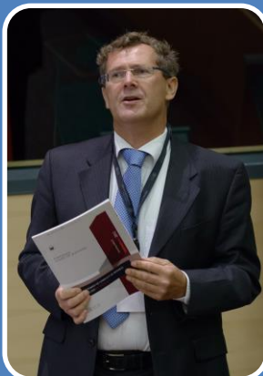
Cooperation with ASOSAI, OLACEFS, ARABOSAI, AFROSAI, IDI, ISSAI 30 review team, OECD Public Sector Integrity Division and EIPA